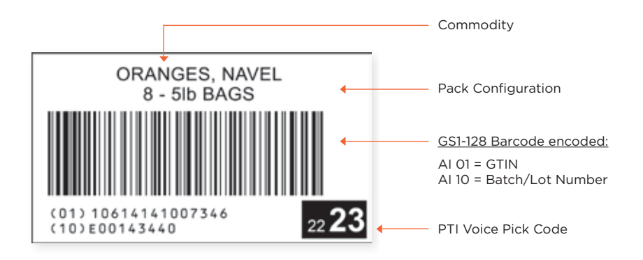
Figure 4: PTI compliant case label encoding barcode with GTIN and Batch/Lot data for traceability.

As an example, in 2008, The Produce Traceability Initiative (PTI) was created to address case-level traceability with the active involvement of working groups representing every aspect of the produce supply chain. PTI incorporates the use of GS1 Standards for product information to efficiently track products and establish electronic recordkeeping of product data from farm-to-store or farm-to-restaurant. The reason the PTI decided to use GS1 Standards is that the grocery channel is already heavily invested in these standards for consumer packaged goods.