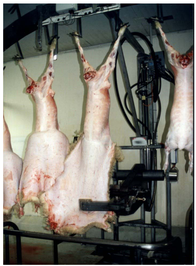
Figure 1. Typical skin puller used with inverted dressing systems.

Where there has been urine contamination, AQIS requires the affected areas to be extensively trimmed. Urine is difficult to identify on the processing chain and the extent of contamination cannot be easily determined. The extent of the trimming required by AQIS varies with the type of dressing system but generally is most extensive when inverted systems are used for smallstock.