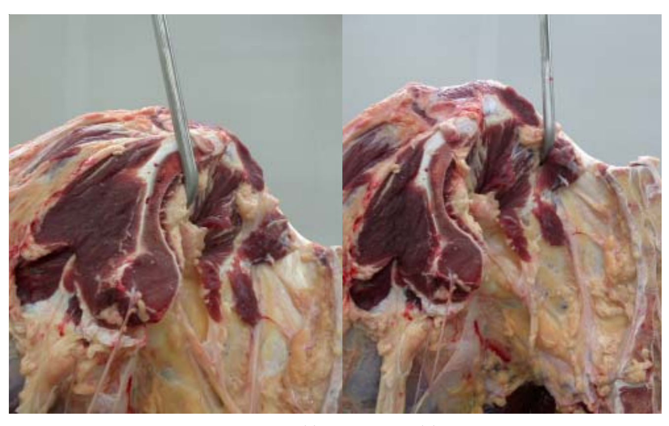
Figure 3. Sides can be hung by the aitch bone (L) or the ligament (R).

the loin muscle, there was a trend for suspension by the aitch bone to produce meat that was more palatable than the ligament method.