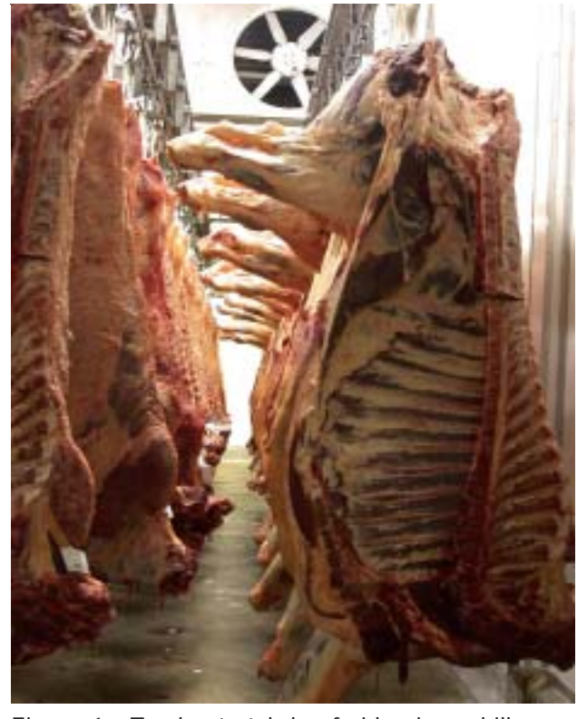
Figure 1. Tenderstretch beef sides in a chiller

Electrical stimulation involves the application of a suitable electrical current to the carcase either immediately after slaughter, or at the end of the dressing line. This rapidly converts the muscle glycogen to lactate, lowering the pH and speeding up the onset of rigor mortis so that by the time the muscle temperature is reduced, the fibres are unable to contract (cold shorten) and toughen. The degree of electrical stimulation must be controlled however, so that the pH does not fall so rapidly that there is the danger of heat shortening.