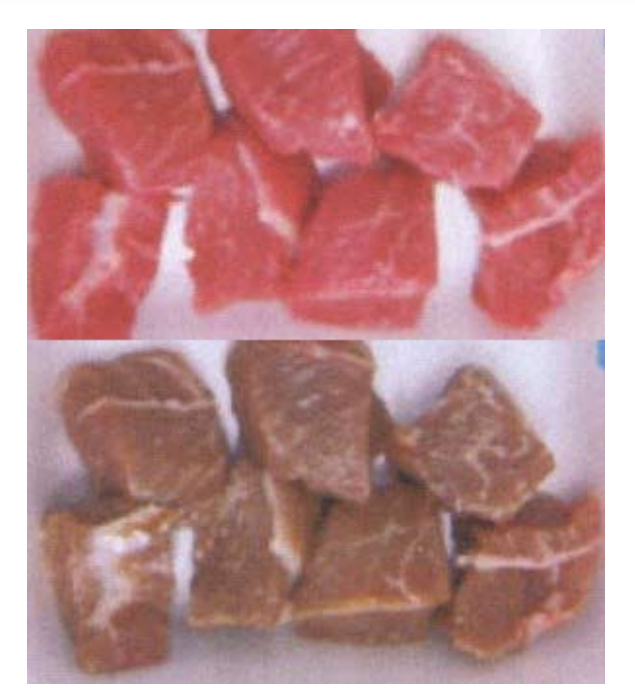
Figure 1: Loss of bloom (oxymyoglobin) and development of brown discolouration (metmyoglobin) after 3 days on retail display.

occurs progressively, blooming takes up to 30 minutes; it is for this reason that colour appraisal of meat should not be carried out until after it has been exposed to air for 30 minutes. The oxygenated layer is only 3–4 mm at 0 °C, even less at higher temperatures.