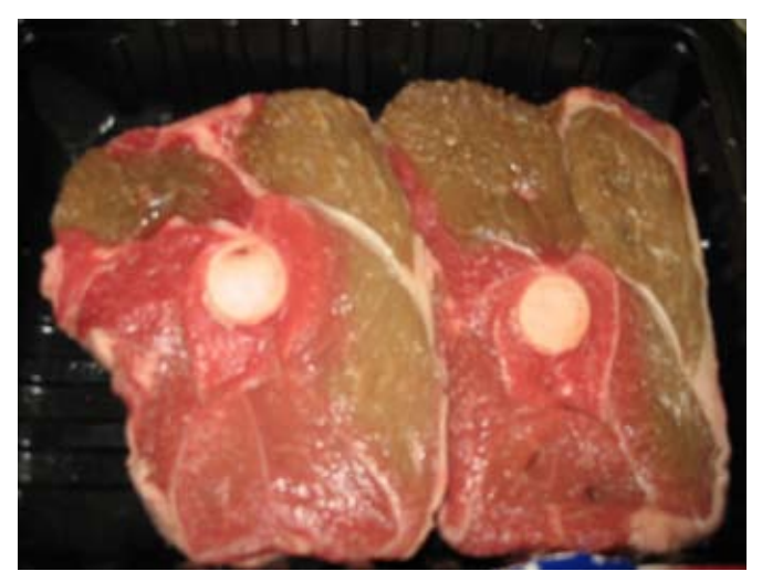
Figure 2: Evidence in lamb leg steaks of a muscle-to-muscle difference in colour stability.

Two-toning can also refer to browning of some parts of the cut surface of a piece of meat. Different muscles have different biochemical activities, so the rate of discolouration differs between muscles, and this can lead to different colours in a single cut (Figure 2).