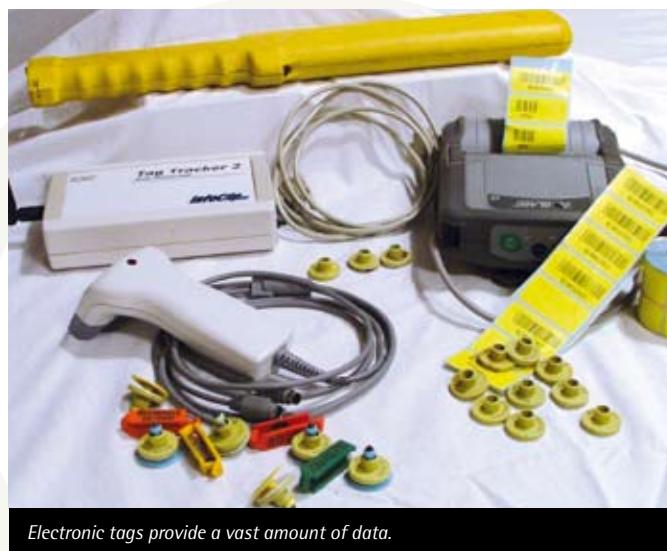
Electronic tags provide a vast amount of data.

“It never occurred to us before but some lambs follow their dams closely and others don't. It appears from our initial work that the lambs that follow their mother closely have a heavier weaning weight. We obviously need to research this further.”