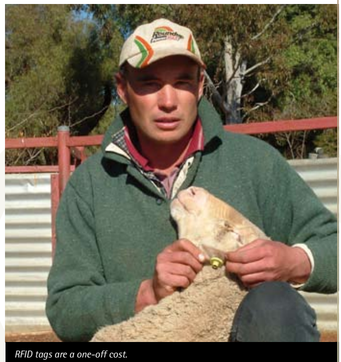
RFID tags are a one-off cost.

The RFID tags are also utilised at shearing. Typically the hogget's tag is scanned as the sheep comes onto the board. A label is