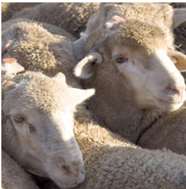
Accuracy is improved with tagged sheep.

“They can see how well the system works and they have technical support available if they need it.”