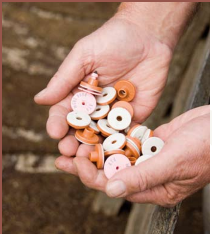
Each RFID tag contains a permanent and unique electronic identification number.

The portability of a laptop is its key feature, however battery life is limited and they don't cope with the elements, especially dirt and water. There is also another option of using a hand-held portable computer that can be used in the paddock and yards.