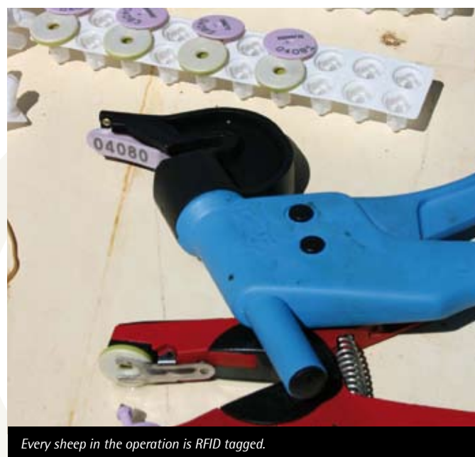
Every sheep in the operation is RFID tagged.

“By continually reviewing animals and drafting animals that need assistance onto supplements, we will be able to ensure they all meet weight targets. That should mean extra value for processors and extra dollars for us.”