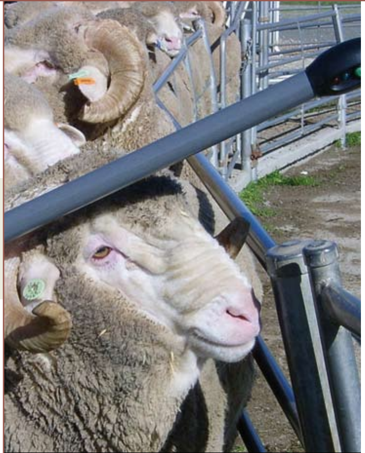
The accuracy and speed of PSM has been a benefit at Collinsville.