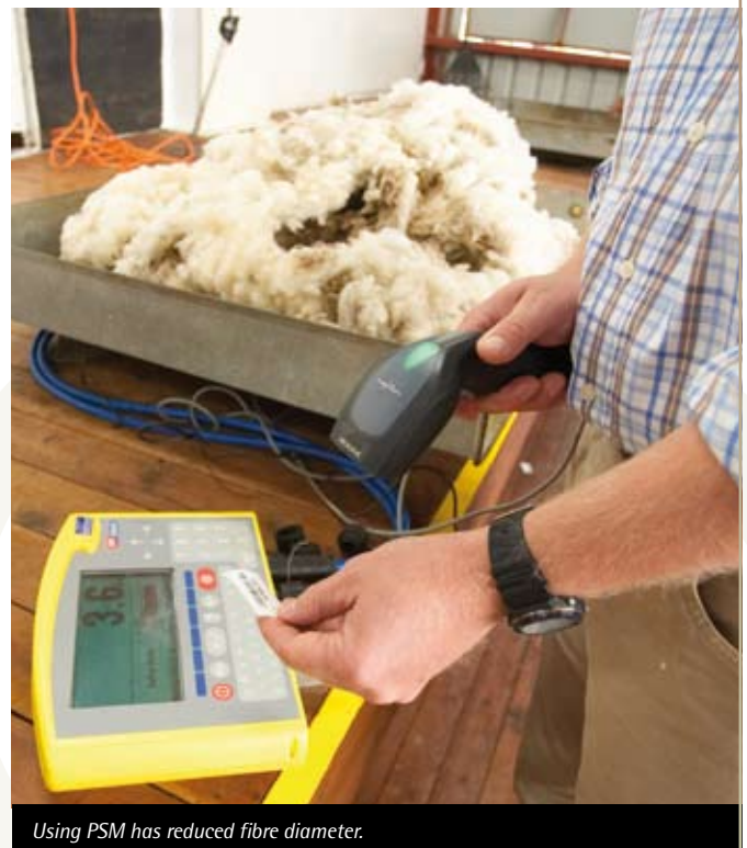
Using PSM has reduced fibre diameter.

“The auto-drafter used in the trial was able to achieve weighing and drafting speeds of around 300 sheep per hour, which is double that of manual weighing and drafting,” Guy says.